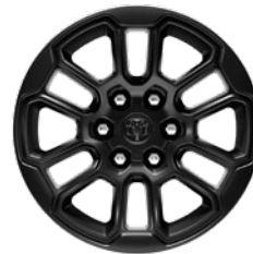
18-Inch mid-gloss black painted aluminium