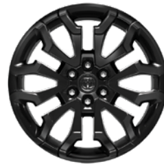
22-inch Premium black painted aluminium