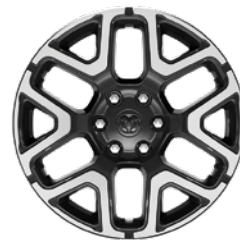
20-inch Premium-painted/ polished aluminium