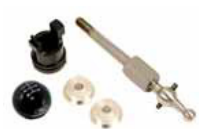
Short Throw Shifter (Shown)