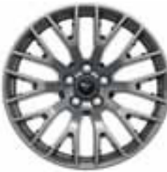
Optional for GT 19" alloy wheels with Lustre Nickel finish