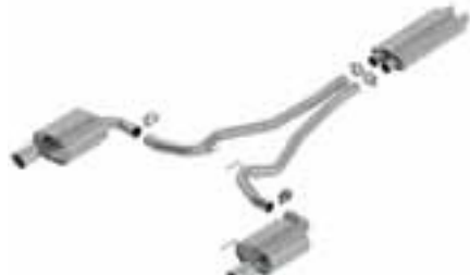
Exhaust Chrome (Shown)