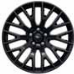
Standard with GT 19" alloy wheels