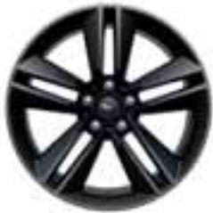
Standard with EcoBoost 19" alloy wheels