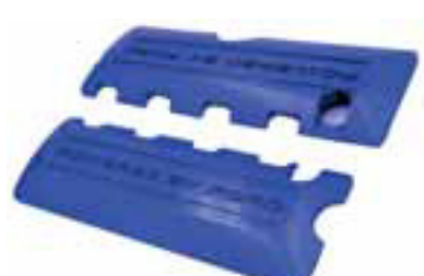
Rocker Covers Blue (Shown)