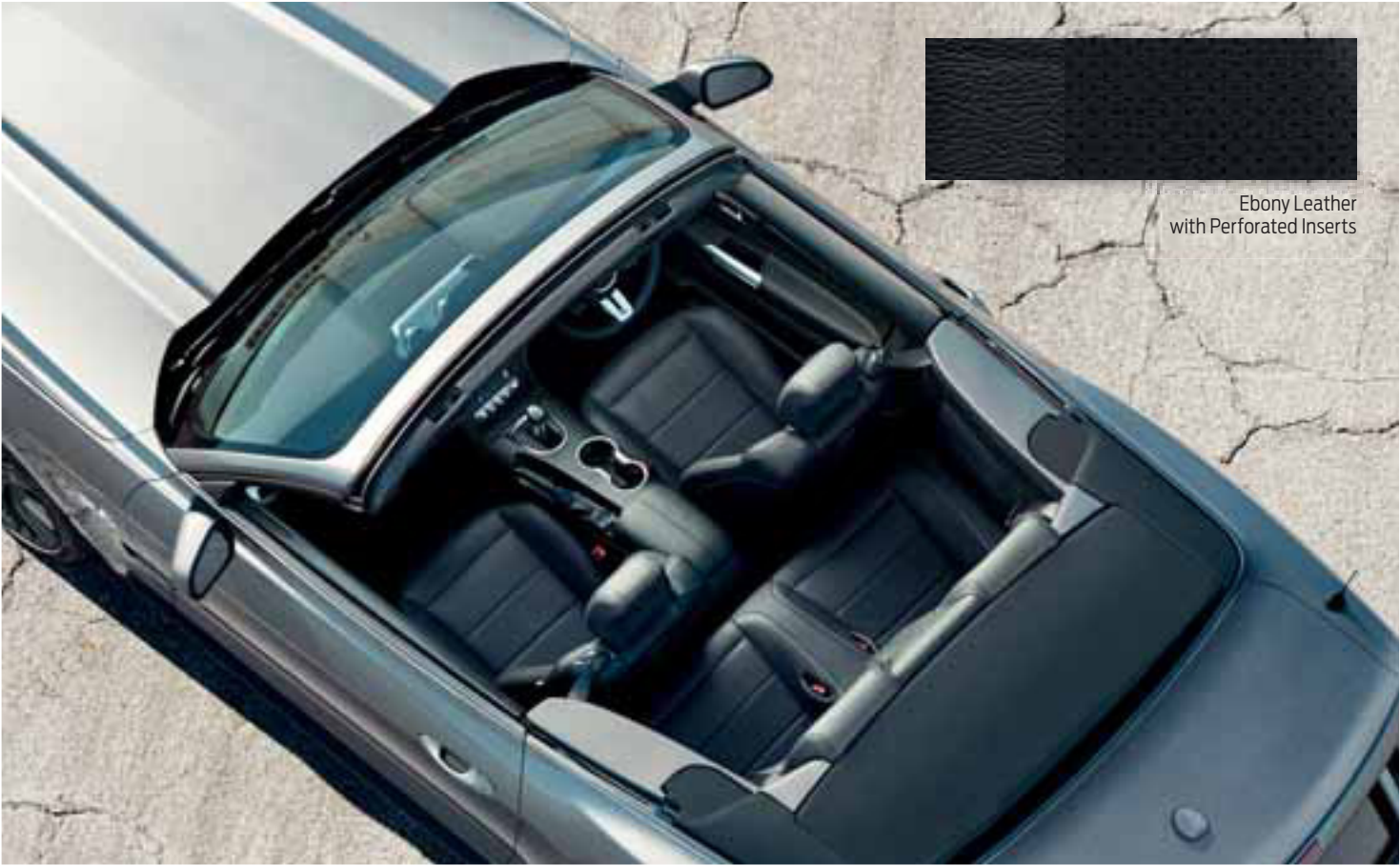
Ebony Leather with Perforated Inserts