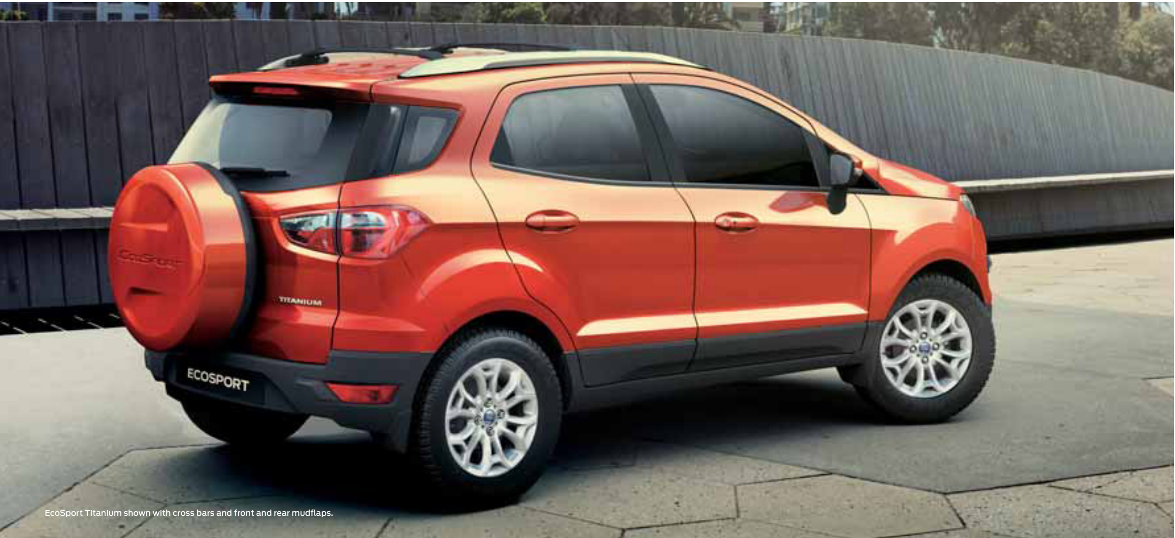
EcoSport Titanium shown with cross bars and front and rear mudflaps.

It's not just an EcoSport – it's your EcoSport. Express yourself with a range of accessories that make any journey uniquely yours.