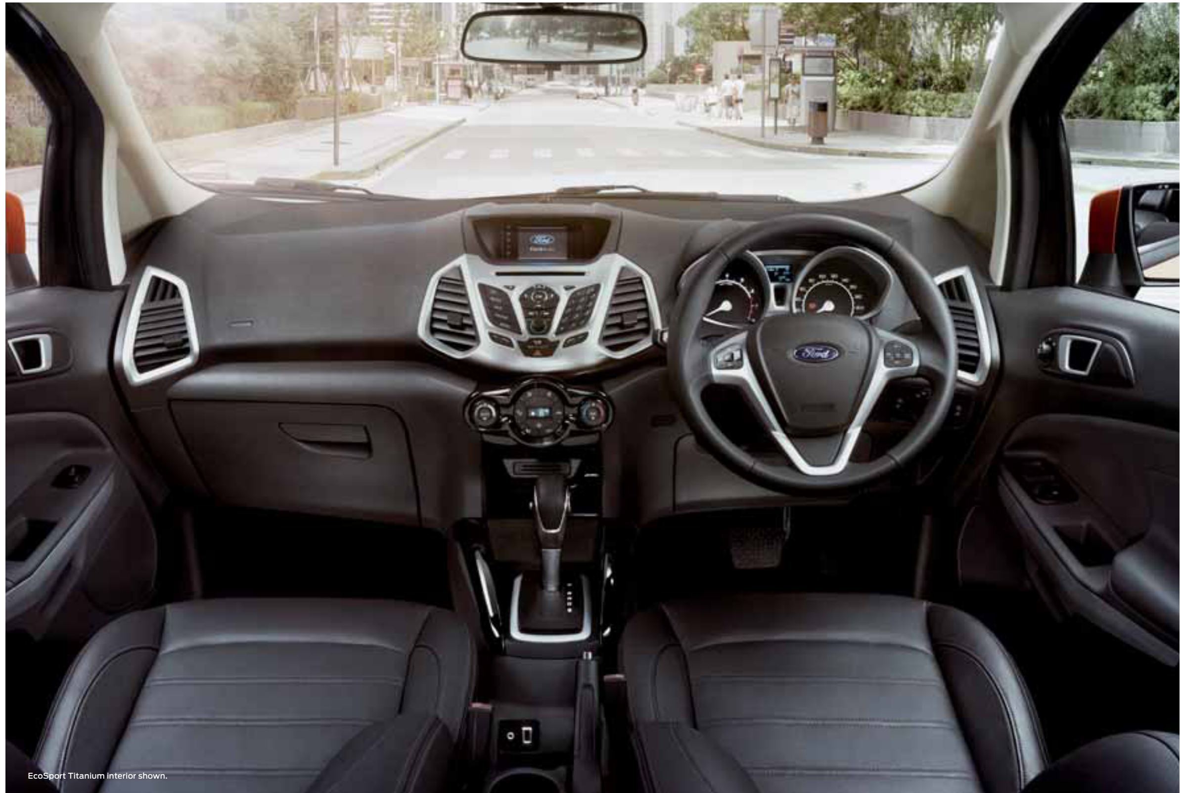
EcoSport Titanium interior shown.