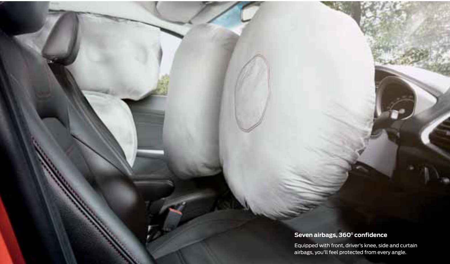
Seven airbags, 360° confidence Equipped with front, driver's knee, side and curtain airbags, you'll feel protected from every angle.