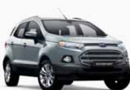
Moondust Silver ^