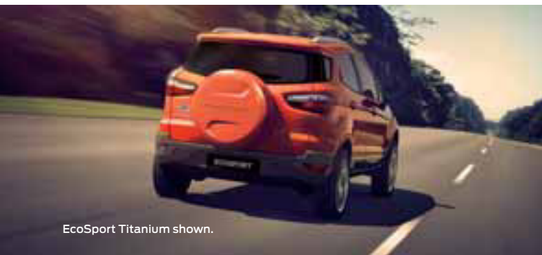
Less noise, more relaxing Enjoy real peace and quiet on the road thanks to the noise reduction materials used in the EcoSport. An acoustic headliner and sound deadening materials in the roof and body, together with a double sealing system in the doors, all help to block out unwanted noise and vibrations.