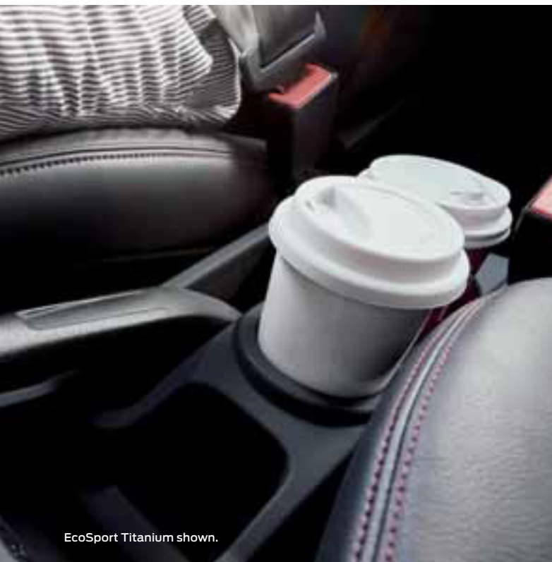
EcoSport Titanium shown.