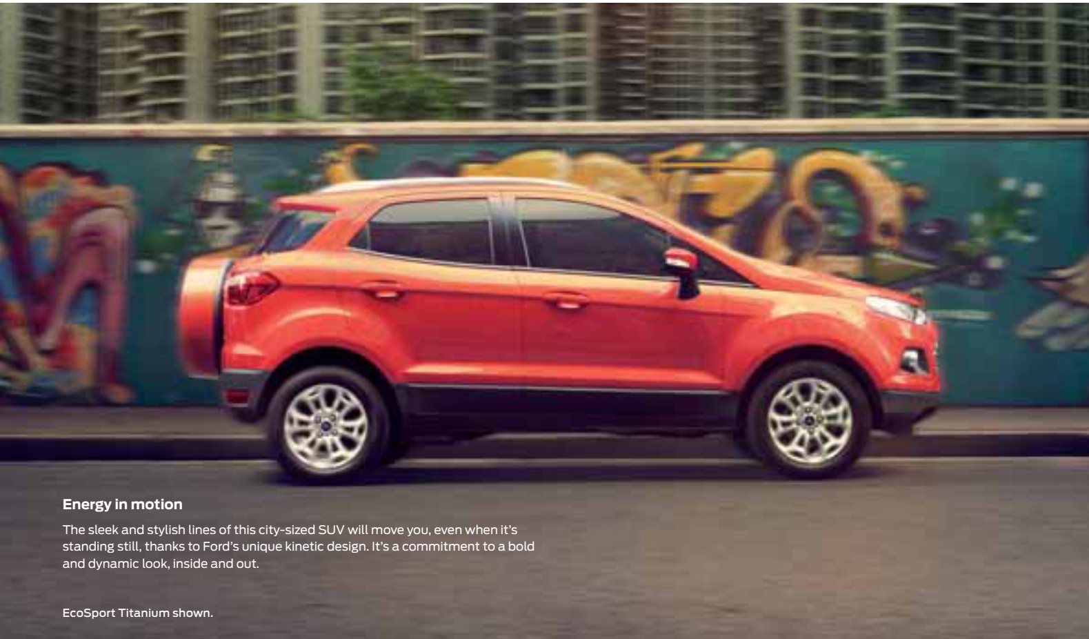
Energy in motion The sleek and stylish lines of this city-sized SUV will move you, even when it's standing still, thanks to Ford's unique kinetic design. It's a commitment to a bold and dynamic look, inside and out. EcoSport Titanium shown.