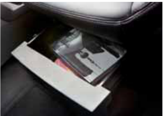
A place for everything... And everything in its place. The EcoSport's 20 storage spaces go beyond the standard door pockets and cup holders to include clever, handy surprises – like a glove box that doubles as an air conditioned beverage cooler on Trend and Titanium models, and a slide-out drawer under the front seat. Even your sunglasses have their own designated space, so everything stays exactly where you want it.