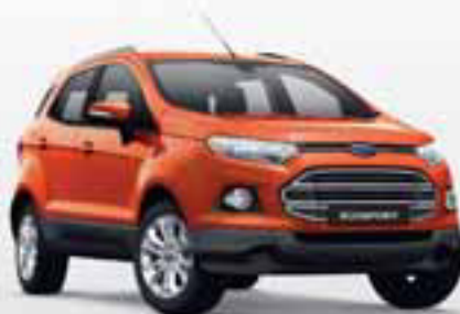
Mars Red ^