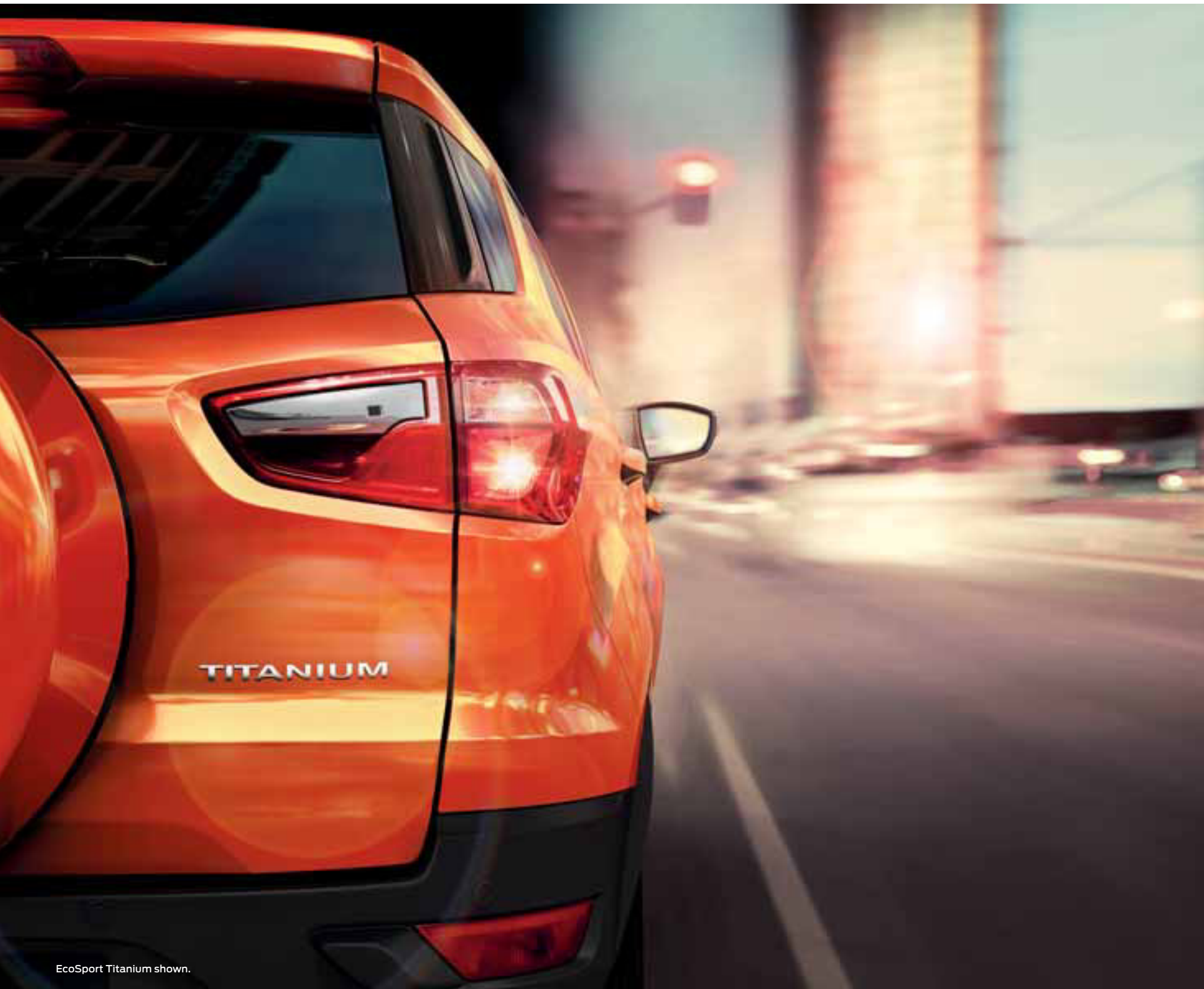
EcoSport Titanium shown.