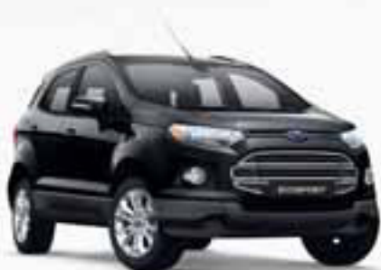
Panther Black ^