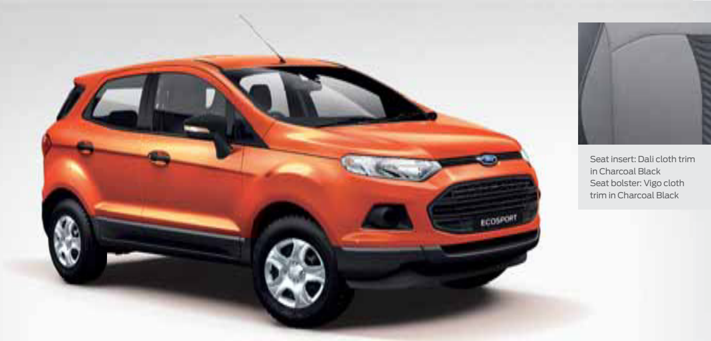
Seat insert: Dali cloth trim in Charcoal Black Seat bolster: Vigo cloth trim in Charcoal Black

Urban discoveries start here. Get into the eye-catching Ambiente, pick up your friends and explore the city in style.