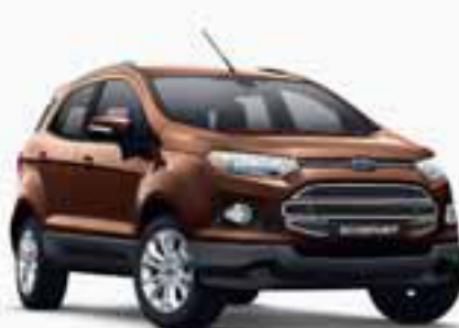
Golden Bronze ^