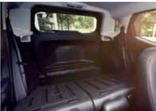
Space that grows Fold down one of the 60:40 rear seats and you can transport long objects with enough room for passengers to stay comfy. Fold them both down, and your 705 litres of space becomes spacious enough to fit everything you need for your next urban adventure.