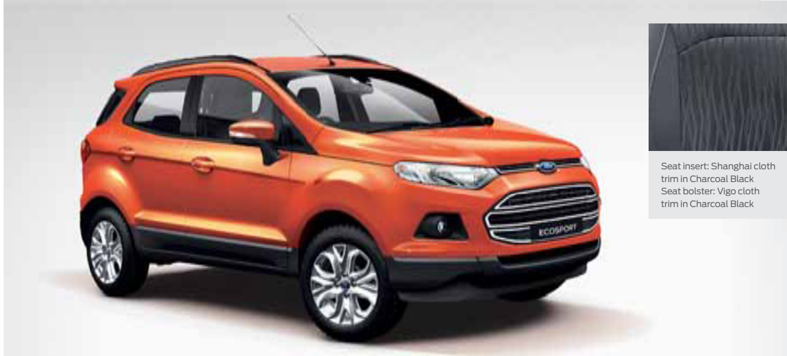
Seat insert: Shanghai cloth trim in Charcoal Black Seat bolster: Vigo cloth trim in Charcoal Black

With a dynamic design that's equally impressive inside, the EcoSport Trend is the city-bred SUV that comes with real street cred.