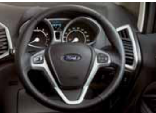
Steering with style Craving a touch of luxury? With its leather trimmed steering wheel, the EcoSport Titanium is happy to oblige.

The EcoSport is designed to be just the right size – and not only because it's compact enough to zip around the city. It's also the perfect size inside, with plenty of room to fit your life, whatever its dimensions.