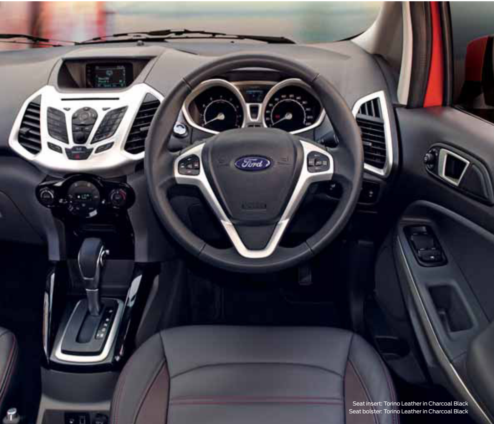
Seat insert: Torino Leather in Charcoal Black Seat bolster: Torino Leather in Charcoal Black

Here, comfort and sophistication go perfectly together. So sit back and relax in the leather accented, sports style front seats.