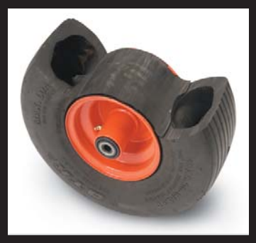
Semi-Pneumatic (Flat-Free) Front Caster Tires Standard with ZG327/ZD331P/ZD326P models