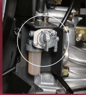
Carburetor Drain Cock *When in use, consult operator manual and handle with care.