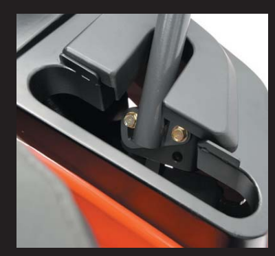
Adjustable Speed Control Levers