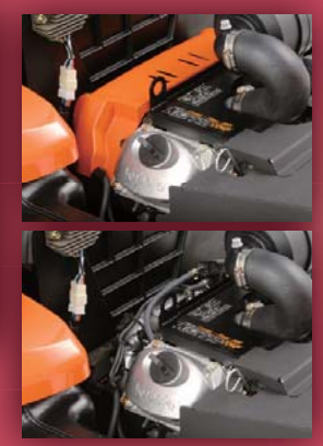
Removable Engine Cover