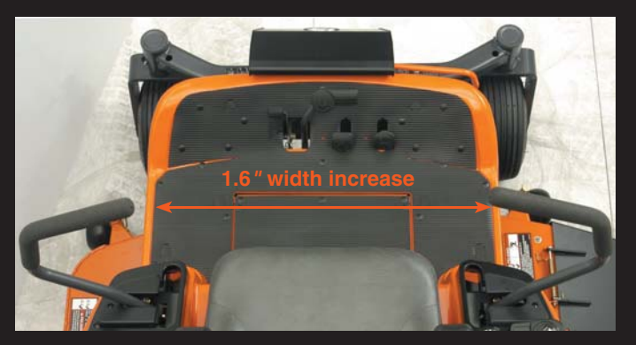
Full-Flat Operator Platform