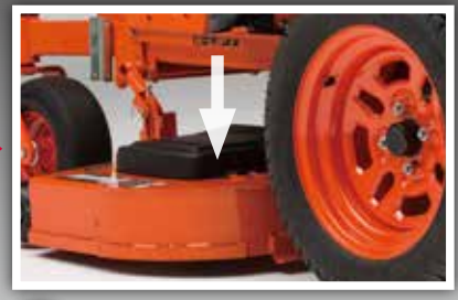
Push and release the pedal again to lower the deck