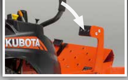
Push and release the pedal to raise the deck