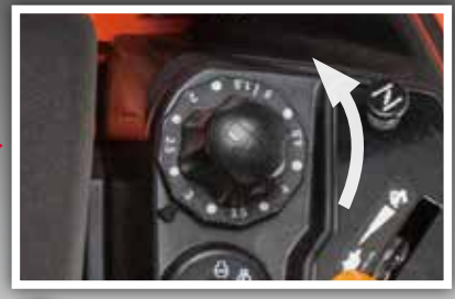
2 Use the dial to adjust the cutting height