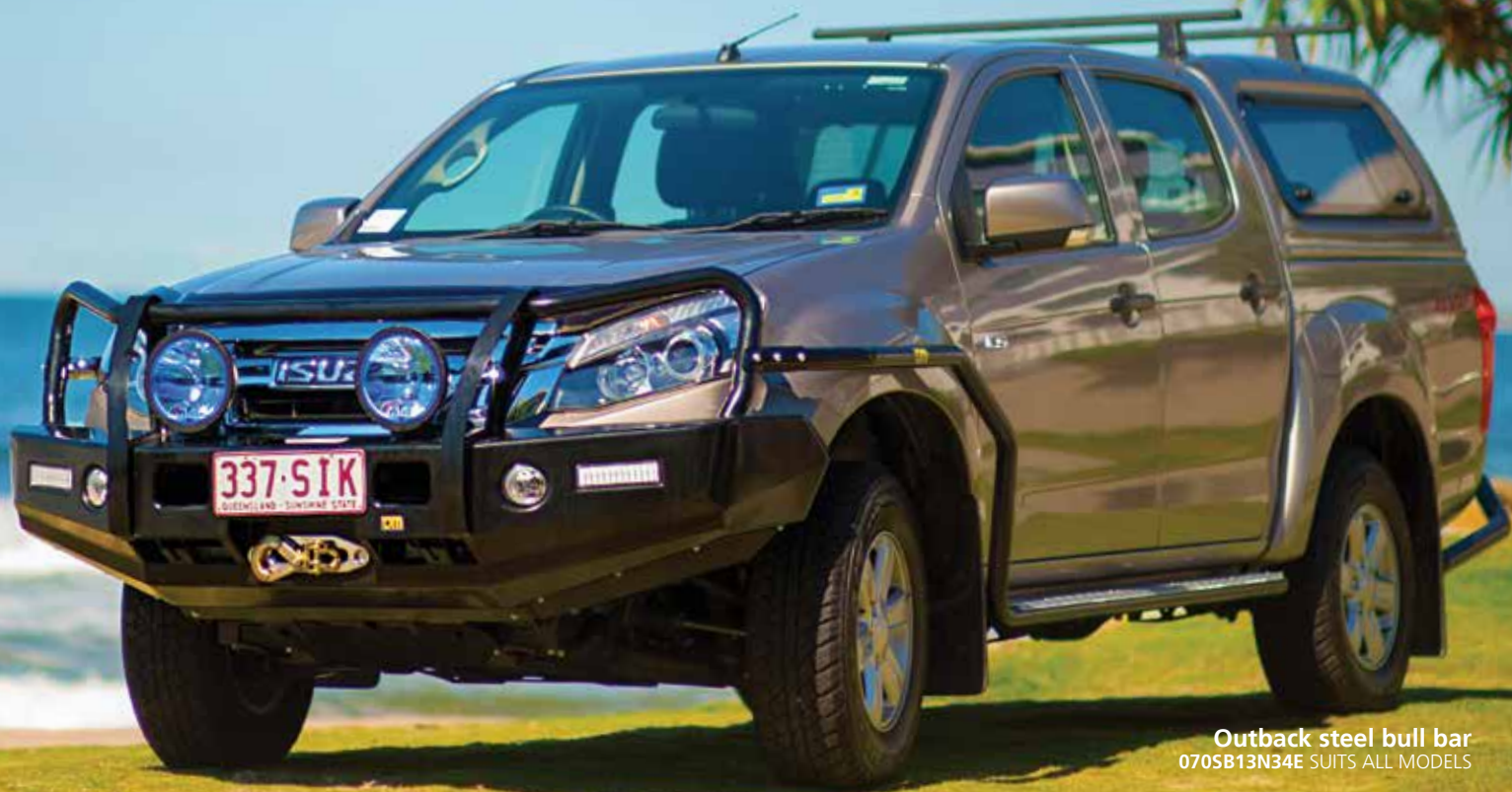
Outback steel bull bar 070SB13N34E SUITS ALL MODELS