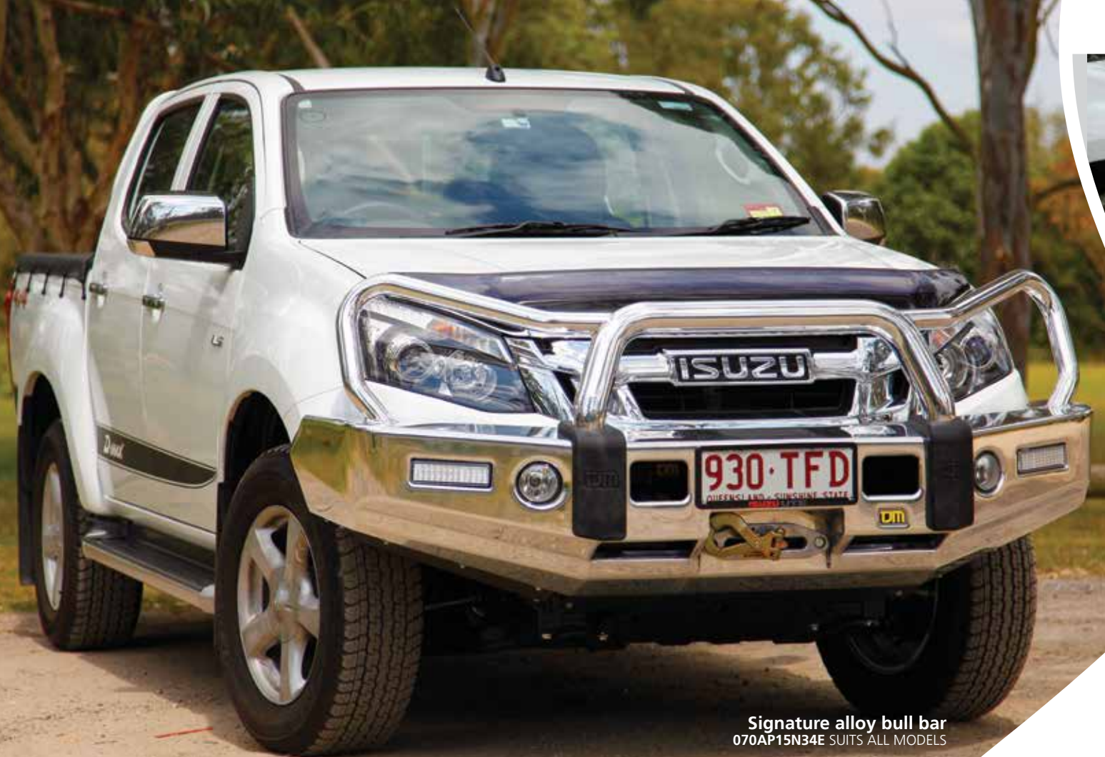
Signature alloy bull bar 070AP15N34E SUITS ALL MODELS