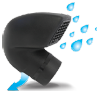
Air Ram 011AR14B97T shown