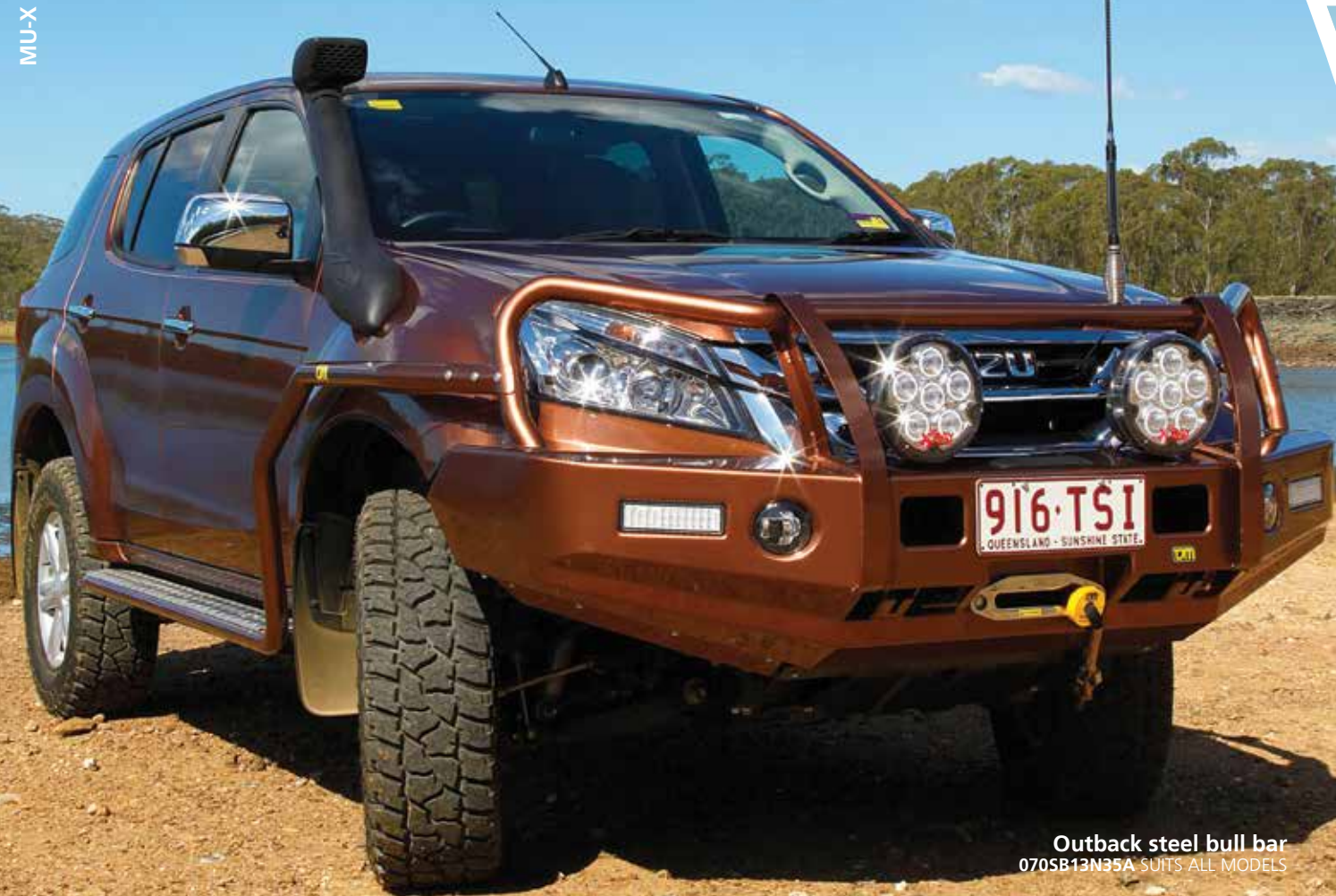
Outback steel bull bar 070SB13N35A SUITS ALL MODELS