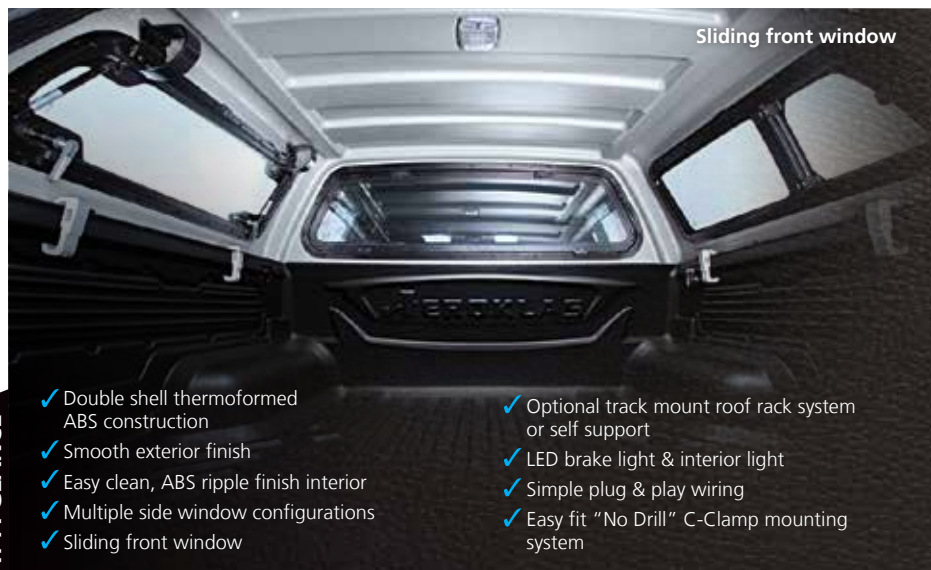
Sliding front window