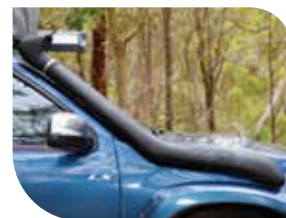
PN. 011SAT0132M (D-MAX 08-12) PN. 011SAT0134E (D-MAX 2012+ & MU-X 2013+)