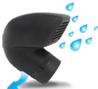
Air Ram 011AR14B97T shown

*It is important that the complete Airtec unit is positively sealed to ensure no water ingress at any point.