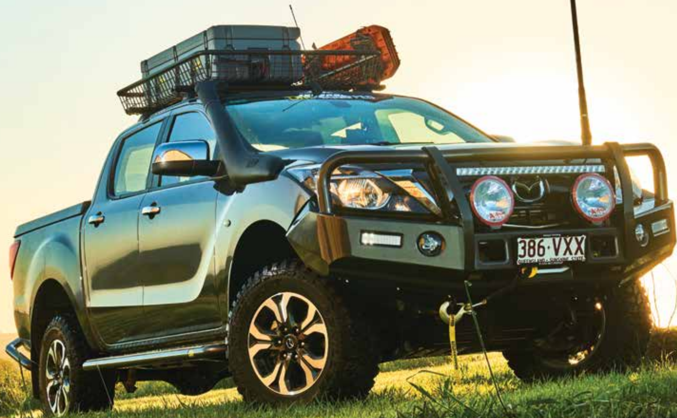
Outback steel bull bar 070SB13L46E - SUITS PETROL & DIESEL MODELS