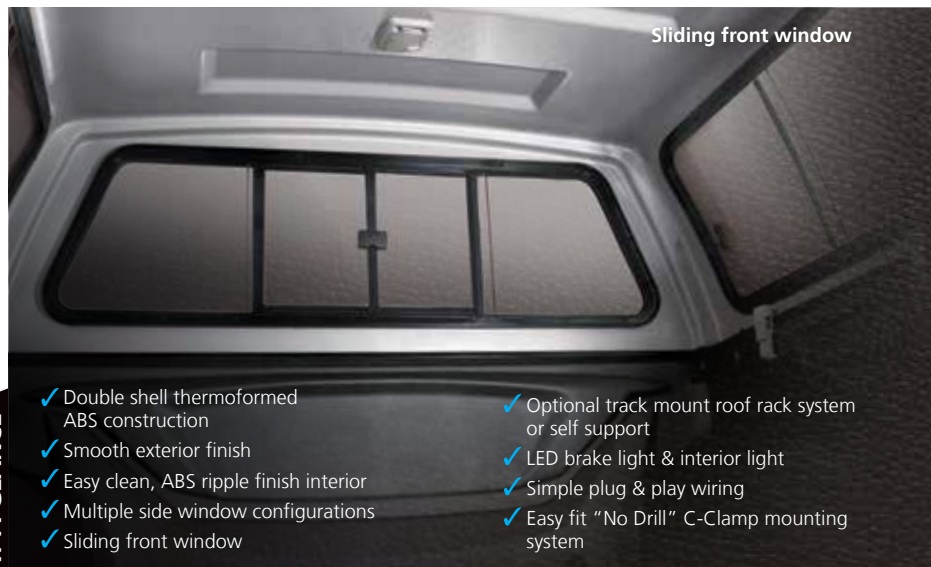
Sliding front window