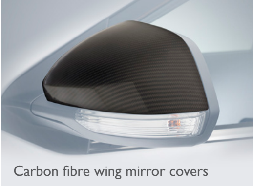
Carbon fibre wing mirror covers