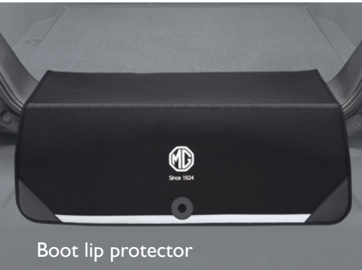
Boot lip protector