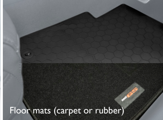
Floor mats (carpet or rubber)