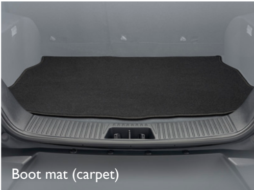
Boot mat (carpet)