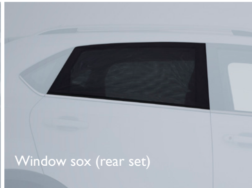
Window sox (rear set)