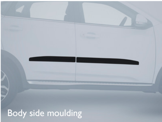
Body side moulding