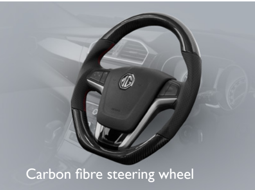
Carbon fibre steering wheel