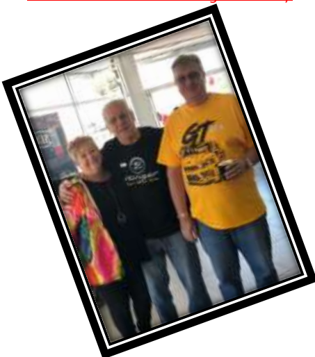
I want one of those T-shirts, please.