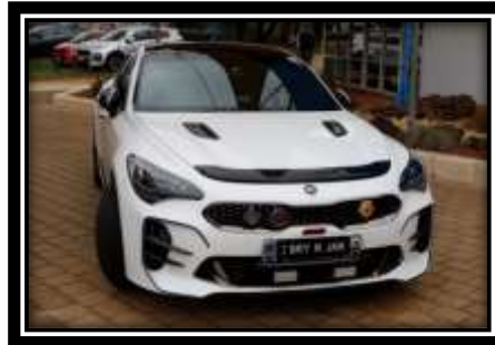
Bryan ran out of room for more badges 😊