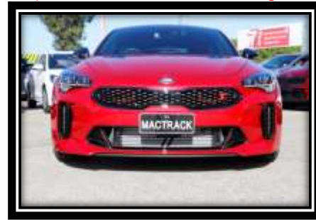
And we're off for the drive