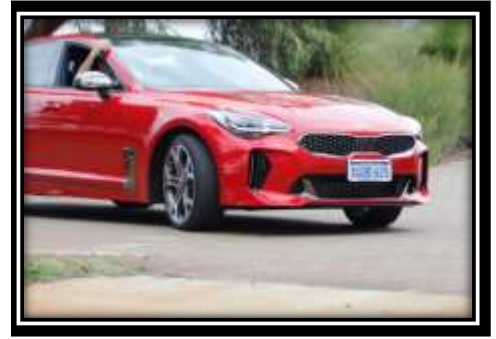
No officer, I was not driving one handed.