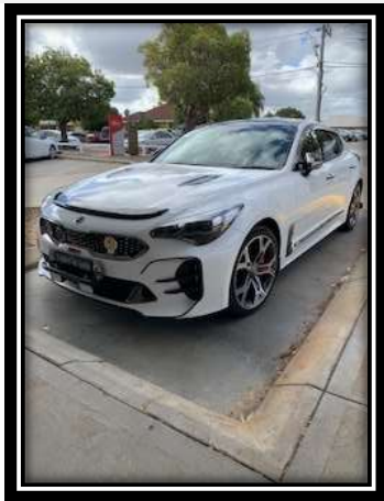
Jan and Bryan took advantage of the huge special saving of the bi-modal exhaust on the day to fit to their stunning Snow White Pearl GT

The fast and (not so) furious Stinger. There are those (myself included) who believe the Stinger is just about motoring perfection. Dollar for dollar, there simply is nothing that comes within a bull's roar of it in features, performance, build quality or safety. Others, as we saw on the drive, like to personalize their car, and some, modify it. Meet Grant Mackie, of Mack Track. While Grant's car is still a 'street' car it has had something like $50,000 of modifications done to it, mostly engineering, suspension, exhaust, and wheels. This car is a rocket, stunning, and lovingly adapted to not only go faster, but to deliver more safety for the increased power. Special thanks to Grant and Susie for coming along and helping to make the day the huge success it was.