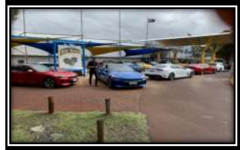
Stingers in the (Whiteman) Park