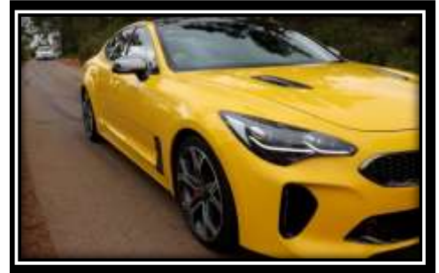
Taking the Zig-Zag like it was on rails