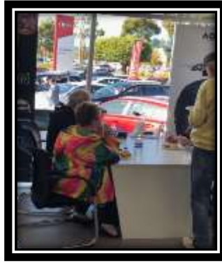
No, oficer, we're not signing for a deal after hours – just eating breakfast.