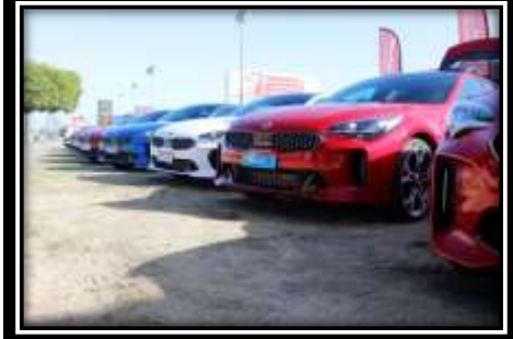
A Long Line of Stingers