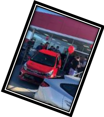
Some of the visitors waiting for breaky