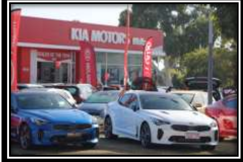
A friendly place to buy your next car 😊