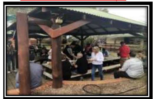
Lunch is served