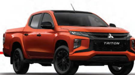
SUNFLARE ORANGE (GSR Model Only)