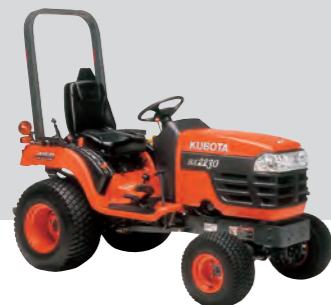
BX30 / BX230 2004

Kubota expands the offering of the sub-compact tractors by introducing the BX30 Series and was one of the first tractor / loader / backhoe models.