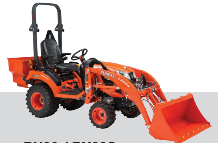
BX80 / BX23S 2017-Today

Started offering drive over mower decks and moved the location of the brake pedal to the left side for more comfort.