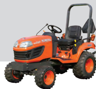
BX60 / BX25 2009

Kubota expands the offering of the sub-compact tractors by introducing the BX30 Series and was one of the first tractor / loader / backhoe models.