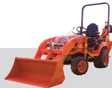
BX70 / BX25D 2013

Further modern innovations and styling with the release of the BX50 Series.