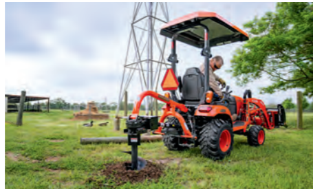
POST HOLE DIGGER