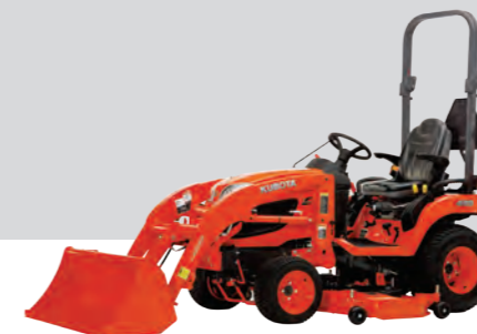
BX70 / BX25D-1 2015

BX60 introduces a higher horsepower model within the BX Series.