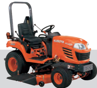
BX50 / BX24 2006

Kubota enters Australia and New Zealand with the sub-compact tractor category.