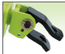
Open Clevis Hitch

• 3pt hitch • Trailing hitch • Standard clevis • Adjustable clevis • Solid tongue • Precision hitch • Laminate tires • Severe Duty tires • Severe duty foam filled tires • Forklift tires • Hydraulic or Non hydraulic rear wheel beam • Pans with Schulte super suction blades • 1/2 length front and rear safety belting