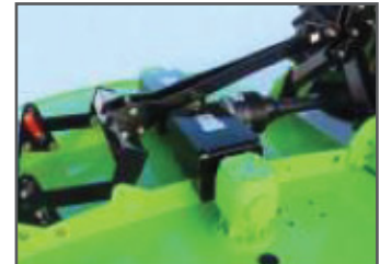
Three Point Hitch