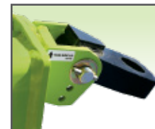
Solid Tongue Hitch