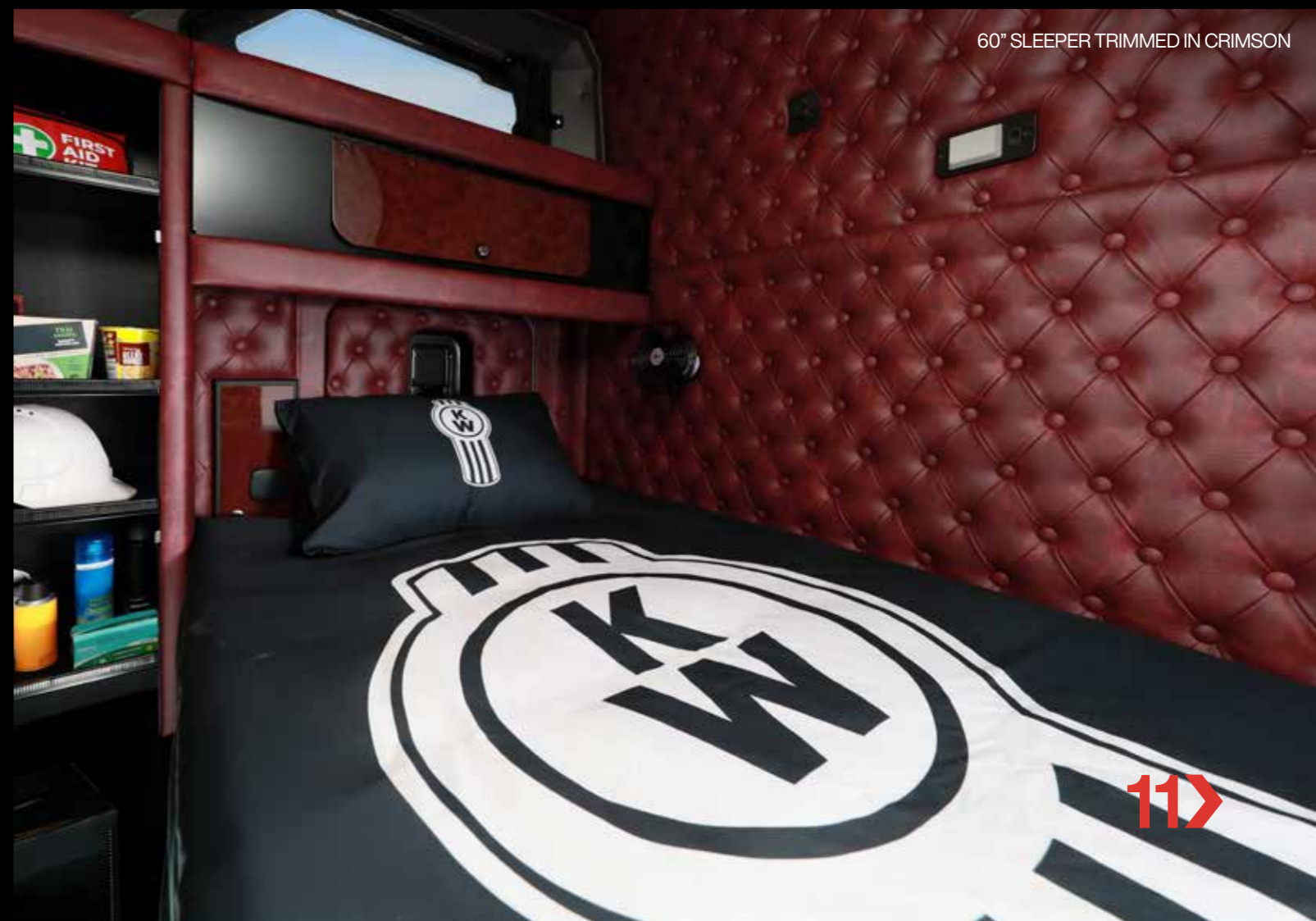
60" SLEEPER TRIMMED IN CRIMSON