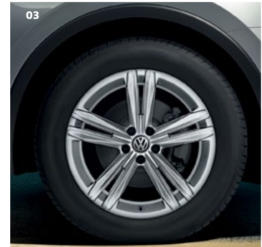
03 Sebring, alloy wheel 18inch, sterling silver Part. no. 5NA07149888Z