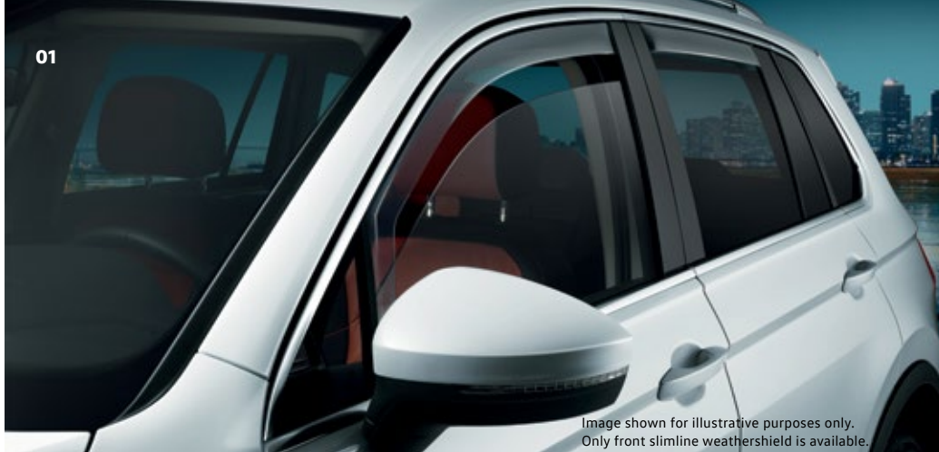
Image shown for illustrative purposes only. Only front slimline weathershield is available.