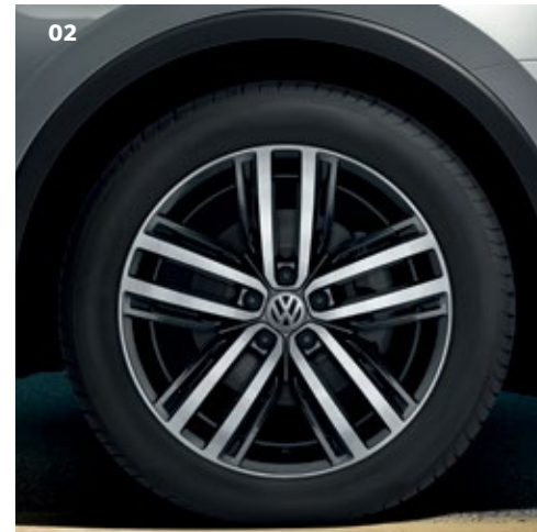
02 Auckland, alloy wheel 19 inch, gloss machined Part. no. 5NA071499NQ9