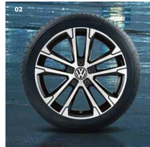
02 Volkswagen Genuine Singapore alloy wheel, 17 inch, black, gloss machined