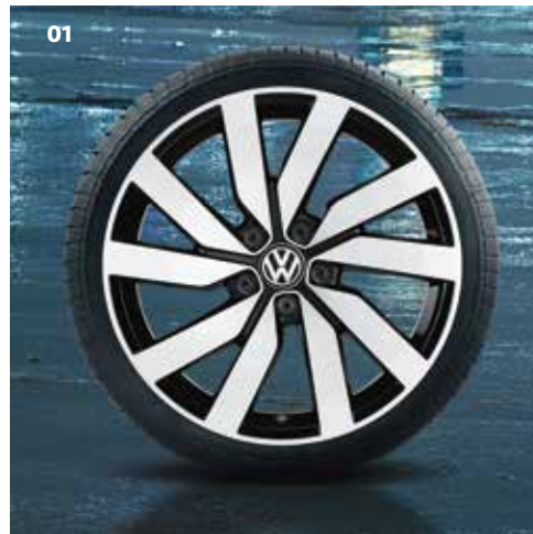
01 Volkswagen Genuine Marseille alloy wheel, 18 inch, black, gloss machined