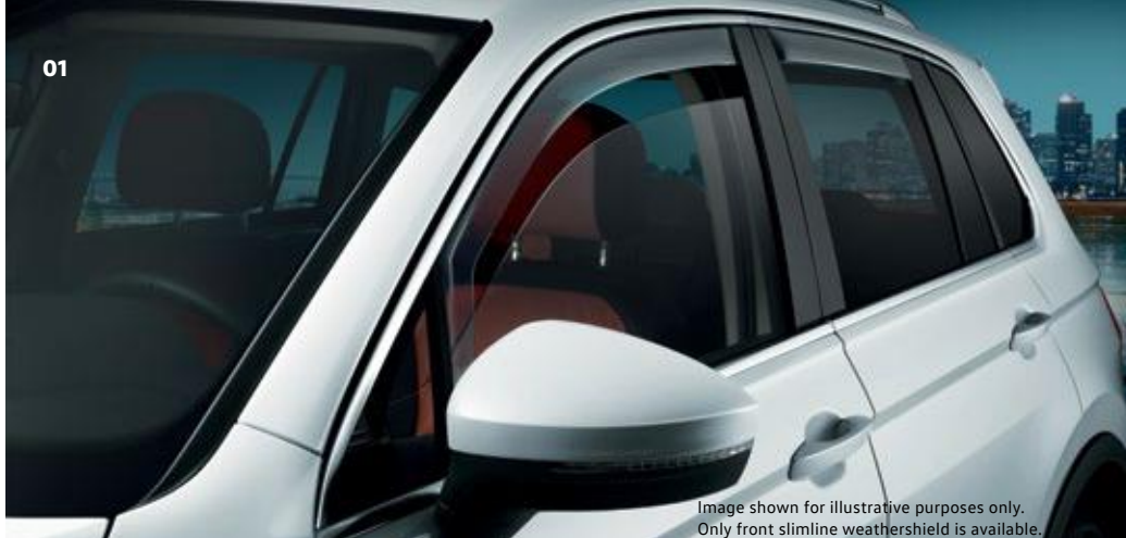
Image shown for illustrative purposes only. Only front slimline weathershield is available.