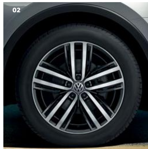
02 Auckland, alloy wheel 19 inch, gloss machined Part. no. 5NA071499NQ9