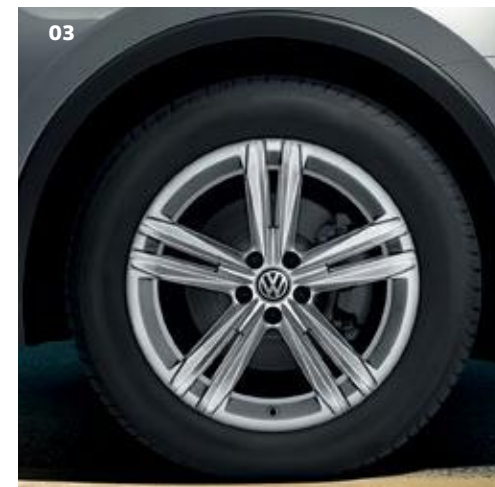
03 Sebring, alloy wheel 18inch, sterling silver Part. no. 5NA07149888Z