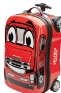
Kids Roller Luggage