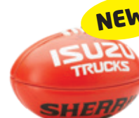
Mini Sherrin Football