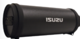
HiFi Bluetooth Speaker