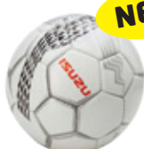
Mini Soccer Ball