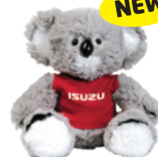
Isuzu Plush Koala