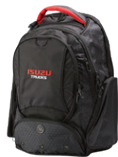
Premium Isuzu Trucks Backpack

VISIT PARTS.ISUZU.COM.AU/FIND-A-DEALER FOR YOUR CLOSEST DEALERSHIP