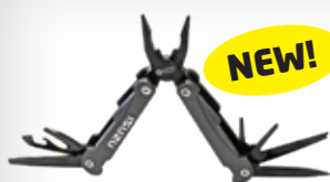
Isuzu Multi Tool

View the full range of merchandise available at our website - isuzu.com.au/about/merchandise or contact your preferred Isuzu Dealer for further details.