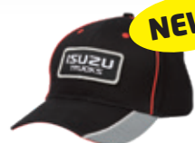
Isuzu Trucks Badge Cap