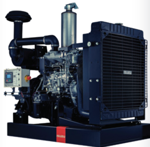
Model shown is 4BG1PWP10

Special pricing available upon request. Please contact your preferred Dealer for details.