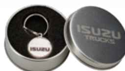
Iron Key Ring With Tin Holder