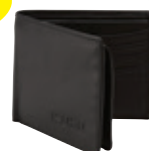
Premium Leather Wallet