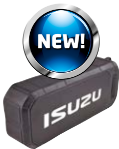
Isuzu Bluetooth Speaker $35.95ea