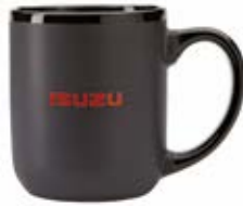
Coffee Mug 480ml $13.50ea