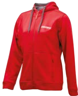
Women's Fleece Hoodie in Red/Charcoal $56.40ea