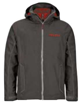
Isuzu 2 in 1 Jacket $157.00ea

Apparel available in various sizes. Please contact your local dealer for more information.