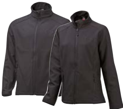
Isuzu Softshell Jacket $62.90ea