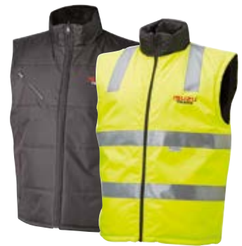
2 in 1 Hi Vis Vest $60.05ea