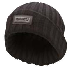
Isuzu Badge Beanie $16.05ea