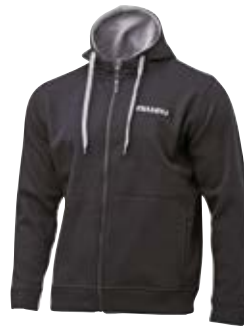
Men's Fleece Hoodie in Black/Grey $56.40ea