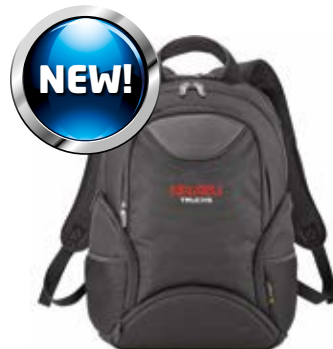
Isuzu Backpack $101.00ea