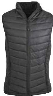
Isuzu Snowy Vest $64.10ea