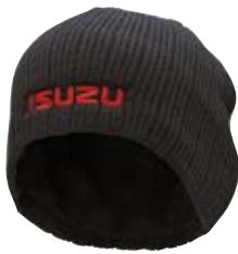
Isuzu Cable Knit Beanie $9.65ea