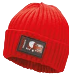
Kid's Red Beanie $15.55ea