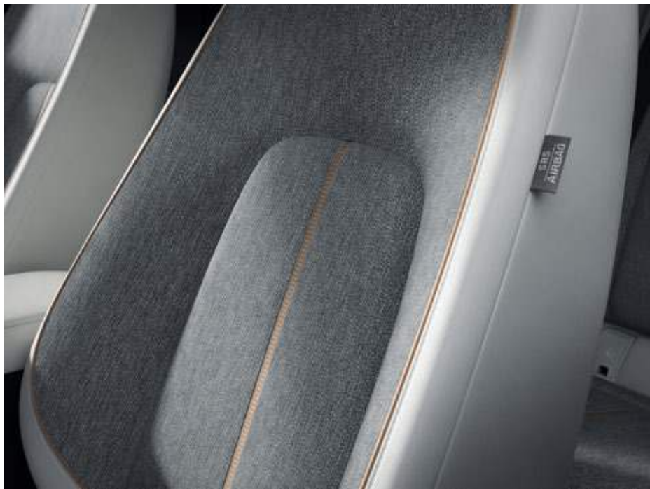
G20e Touring – Pure White Maztex with grey cloth