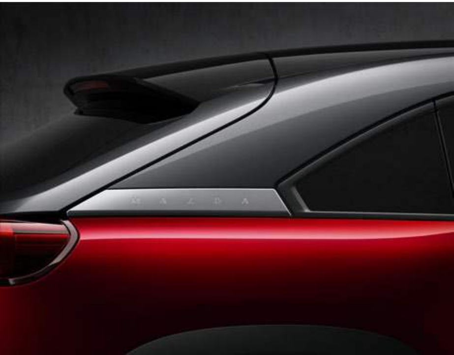
Soul Red Crystal Metallic^ with black roof top and grey sides. G20e Astina model only.