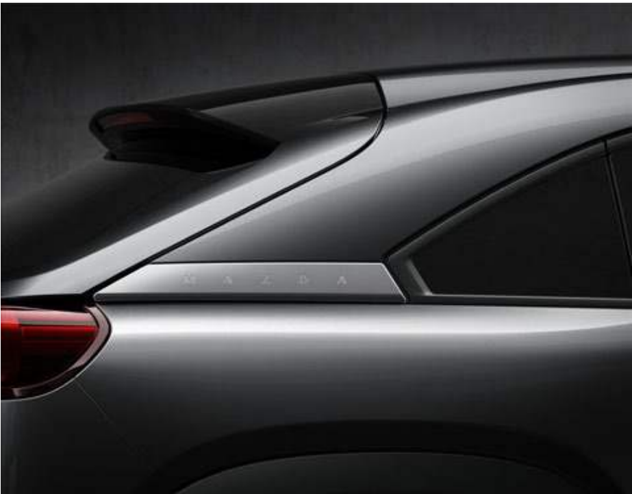
Machine Grey Metallic^