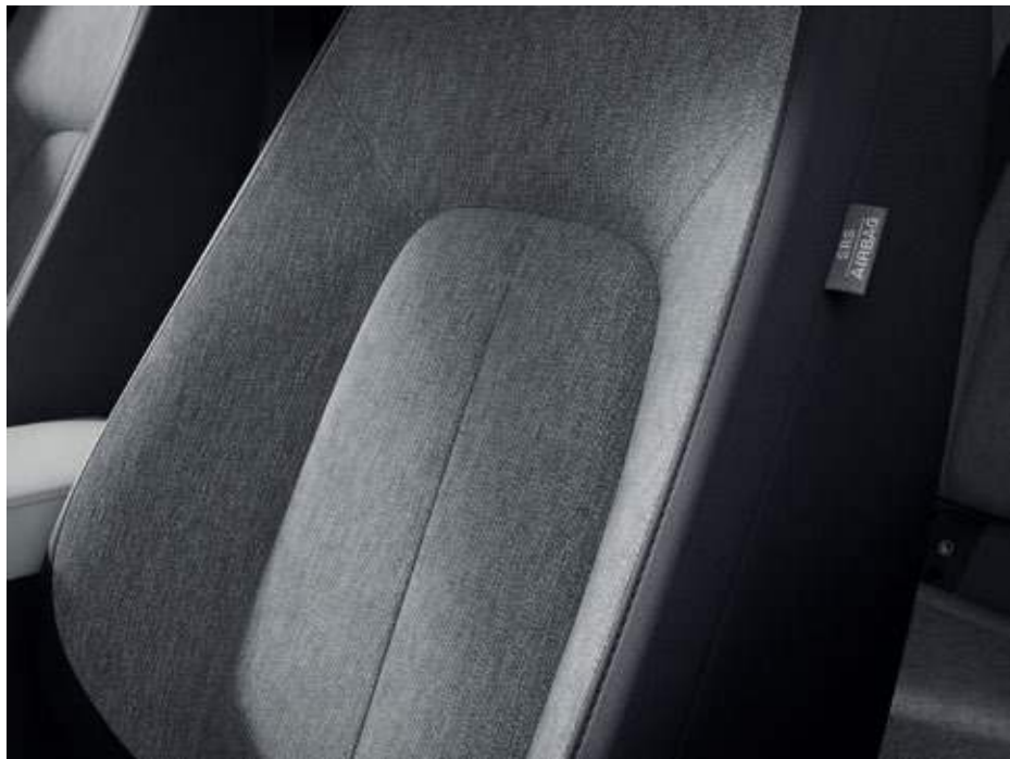
G20e Evolve – Black and grey cloth