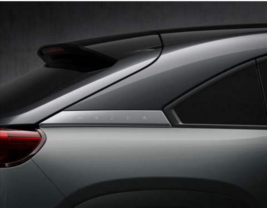
Ceramic Metallic^ with black roof top and grey sides. G20e Astina model only.