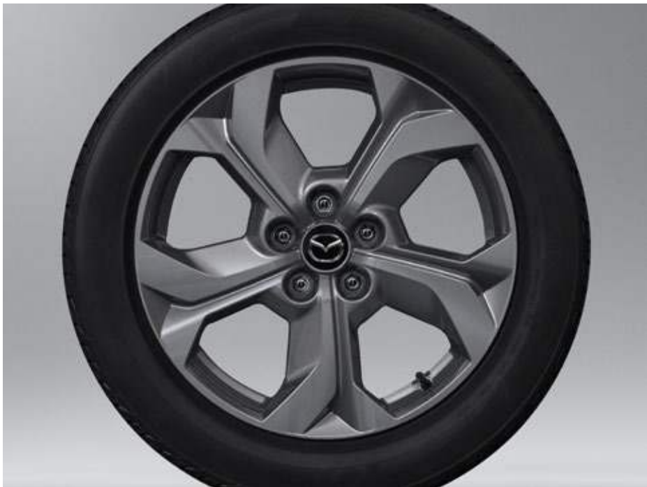
G20e Evolve and Touring – 18-in silver alloy