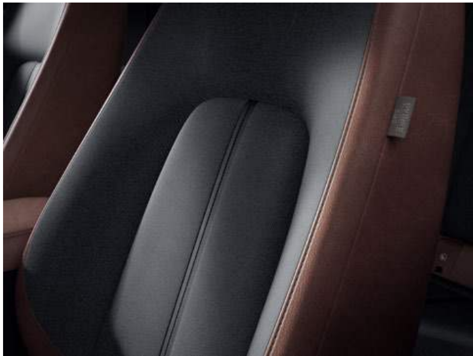
G20e Astina – Vintage Brown Maztex with black cloth