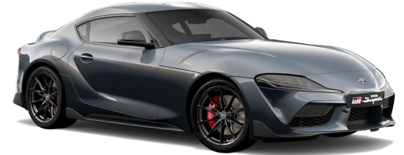
● Copper Grey 4 D14