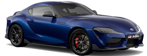
● Azure Blue 4 D13