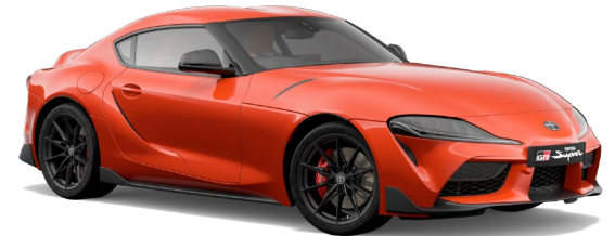
● Plazma Orange 4 D19