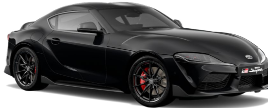
● Bathurst Black 4 D04