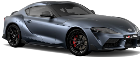
● Nurburg Matte Grey 4 D08