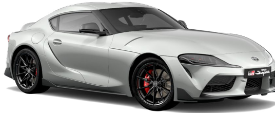
○ Fuji White 4 D01

The on-road performance of GR Supra is matched by a powerful range of colour choices. Whether you prefer bold or a subtle style, there's a perfect colour to match.