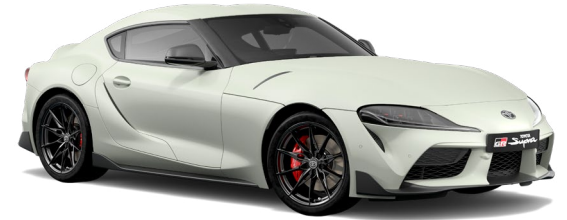
○ Matte White 4 D12