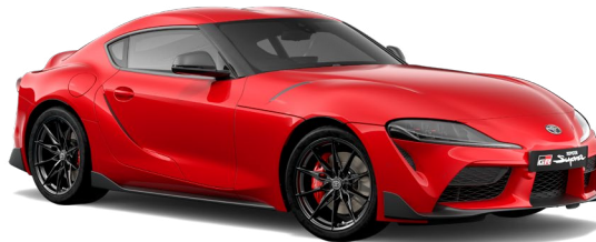
● Monza Red D05